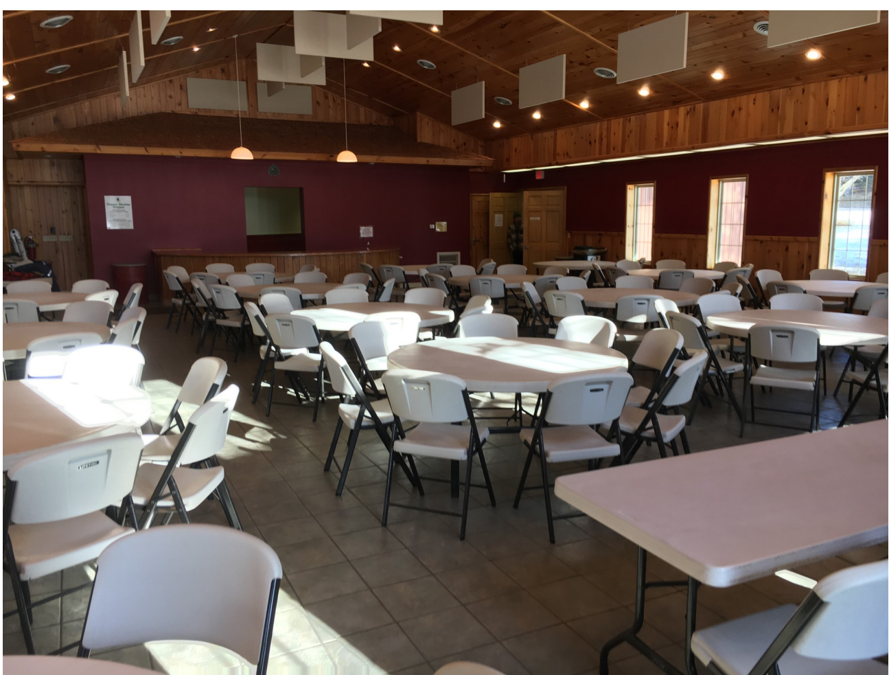
L:/parks/brochures/shelter brochures/Nepco Shelter Brochure.pub