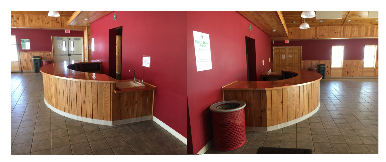
L:/parks/brochures/shelter brochures/Nepco Shelter Brochure.pub